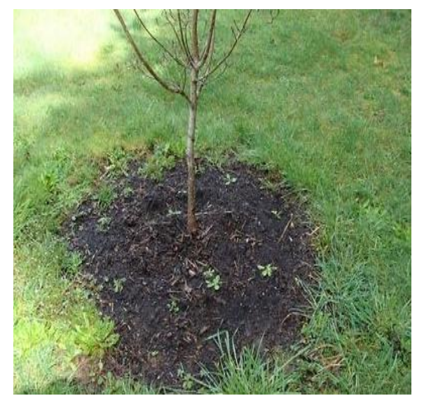
Weeds overgrowth in mulched area.

Unwanted weeds will eventually seed into mulch beds regardless of the materials used. It is important to pull newly emerging weeds or use herbicide treatments to maintain your mulched areas. Using wet newspaper or cardboard under your mulch is an effective way to smother weeds in your mulched beds if you prefer not to use herbicides. Weed control is important to ensure your tree does not have to compete for nutrients.