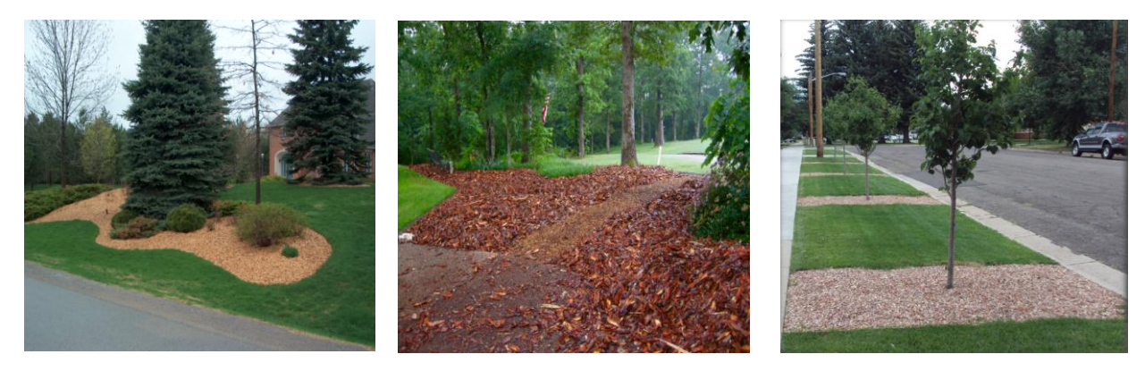
Examples of wood chip, bark, and pebble/stone yard mulch.

There are many mulch options available to homeowners. Organic mulches, such as wood chips, bark and shredded wood will decompose and increase the organic matter of the soil, however they also tend to be dispersed by the wind and require replacement more often. Rock mulches, such as gravel and river rock do not improve soil quality, however they do not need to be replaced.