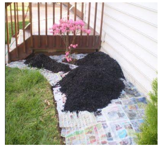
Using wet newspaper to suppress weed growth.