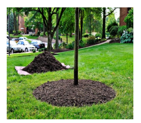
Proper mulch ring around young tree